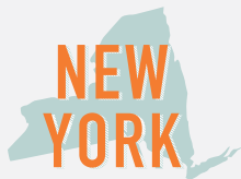
BROAD CHANNEL, NEW YORK